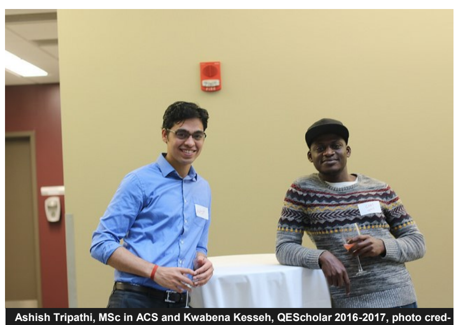
it University of Winnipeg